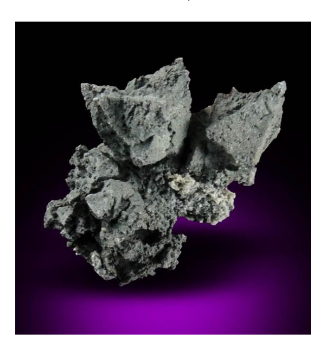
#81944, <u>Acanthite</u>, Mine d'Imider, Morocco Sale Price $22.50