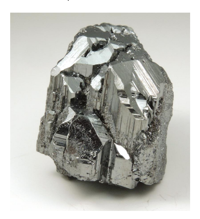
#81551, <u>Bournonite twinned crystals</u>, Yaogangxian Mine, China Sale Price $125