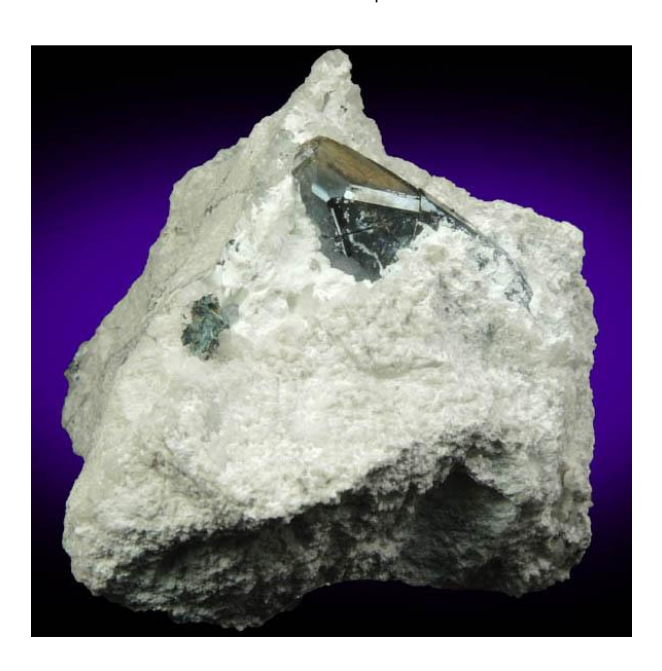
#75757, <u>Chalcocite over Pyrite</u>, Milpillas Mine, Mexico Sale Price $16