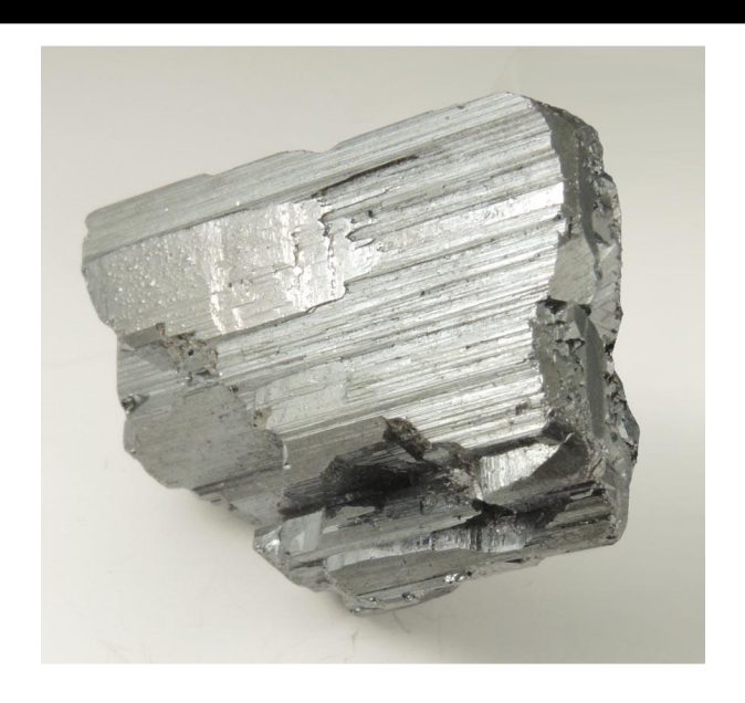
#81546, <u>Bournonite doubly terminated twinned crystals</u>, Yaogangxian Mine, China Sale Price $125