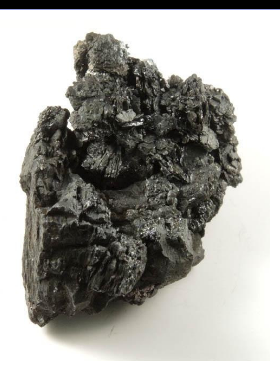
#81595, <u>Chalcocite with Chalcopyrite-Bornite coating</u>, Flambeau Mine, Wisconsin Sale Price $24