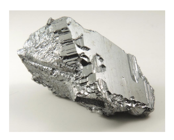
#81550, Bournonite twinned crystals , Yaogangxian Mine, China Sale Price $95