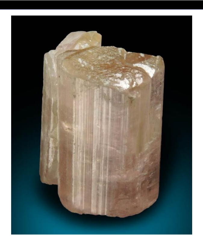
#82689, <u>Elbaite var. Rubellite Tourmaline</u>, Kamdesh District, Afghanistan Sale Price $20