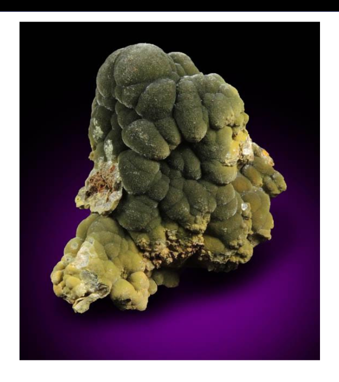
#81842, <u>Mottramite</u>, Mina Ojuela, Level 35, Mexico Sale Price $12.50

Minerals priced above $100 at deep discounts up to 65% off retail. See these minerals at: BEST MINERALS SALE