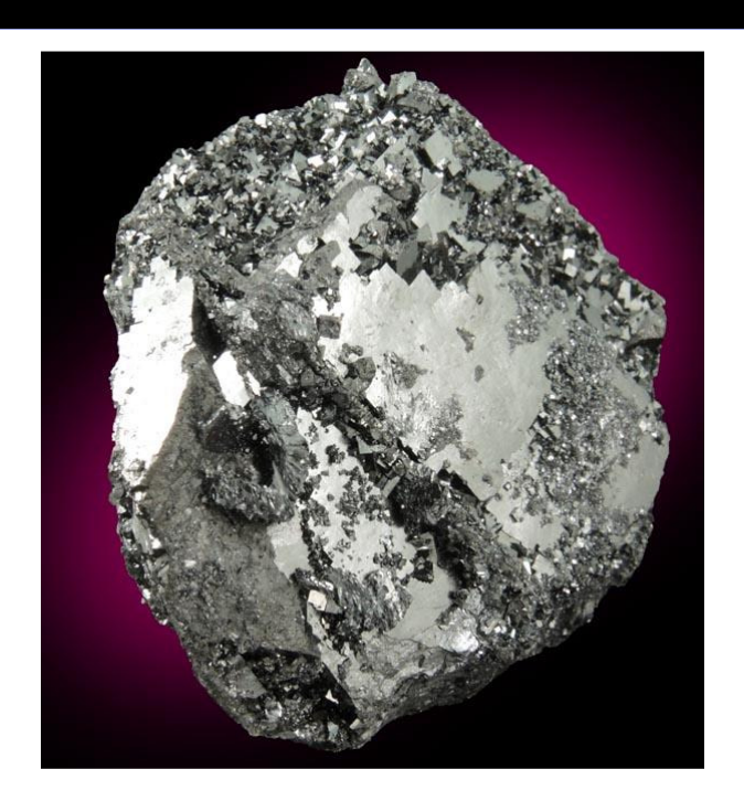
81529, <u>Bixbyite</u>, N'Chwaning II Mine, South Africa Sale Price $75